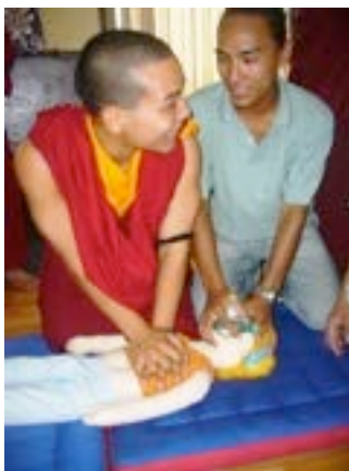
Monks participating in a health education session on first aid.

In 2009, 2,420 persons (adults, children and teenagers) participated in these programs. The number of participants in the various sessions was reduced compared to last year in an effort to increase the impact of the program; we organized the sessions into smaller groups to allow for better participation and interaction.