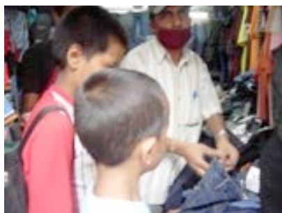
Children attending the Pegasus school choosing new clothes for the Dasain festival, the biggest festival in Nepal.

The clinic sponsors the education of 52 children. These children come from particularly destitute families. They are sent to class 1 in school; the eldest child in this program is now in class 8.