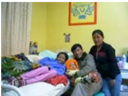
A family gathering

The four rooms dedicated to palliative care accommodate eight patients, each with their own bed and personal space, at the end of their lives. Palliative care is a holistic way to provide care to the patients and all aspects of life are attended. We are qualified in physical pain management and equal importance is attached to psychological and spiritual pain, helping patients to face the reality of imminent death. In 2009 our hospice/palliative care unit had an occupancy rate of 90 %.