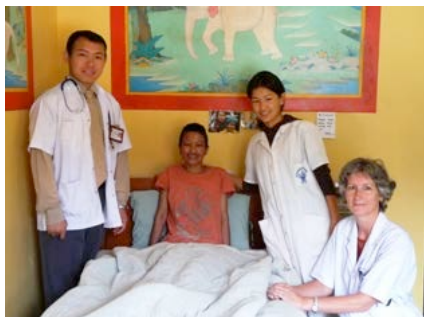
Practical training at the Palliative Care Unit

During 2009 all members of the clinic staff benefitted from training in various topics related to their work, such as cardio pulmonary resuscitation, diabetes, palliative care training, etc.